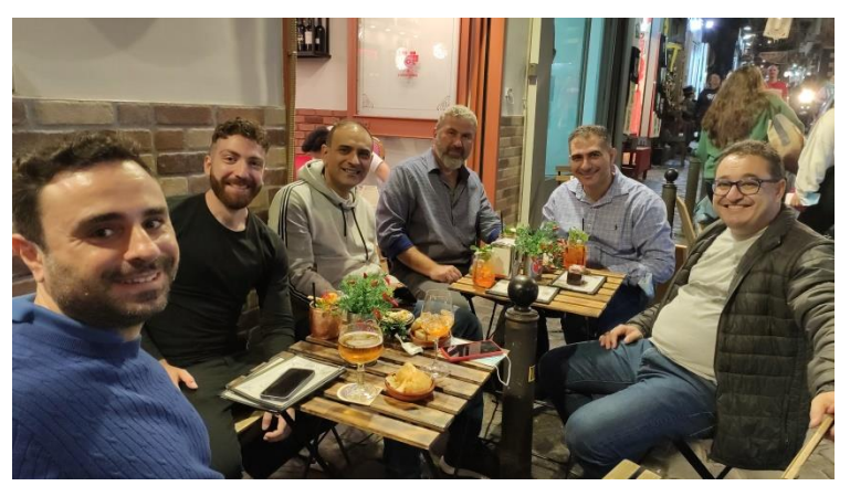
Café Bar near Historic Centre, Naples

After a full day at the university facilities, the FRC and CUT members went out to the market to get to know the city, to see the sights such as Bourbon Tunnel (left photo), Palazzo Reale (Royal Palace), Castel Nuovo as well as to taste the local cuisine such as traditional cheese and sausage pies.