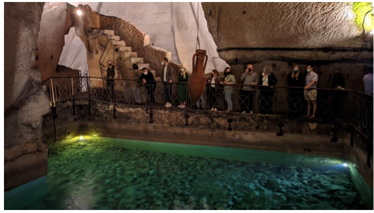
Bourbon Tunnel, Naples